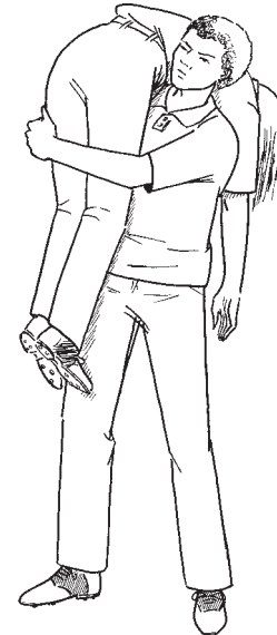
Keep her weight over your back and legs as you walk her to the clubhouse.