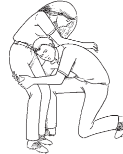
Lean into the injured golfer's body.